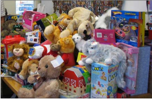
Toys for Tots—What a Haul!