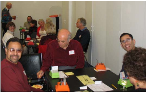
Happy Players in Limited Game